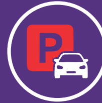
AMPLE PARKING SPACE