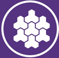
PAVED / INTERLOCKED ROADS