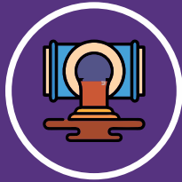
MODERN SEWAGE SYSTEM