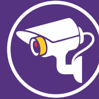
24/7 CCTV CAMERA SECURITY